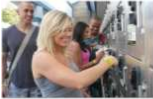
Gyms & Spas

The data on the wristband is accessed by RFID systems such as RFID Smart Readers and can enhance your bottom line and provide unmatched safety, security, and convenience to your guests for: