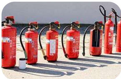
Gas Cylinder Tracking