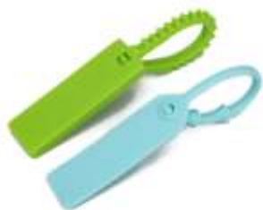
RFID silicone tie tags

Custom RFID cable tie tags made of different material, could offer more choice suitable for your project, such as silicone cable tie tags, ABS cable tie tags, PP cable tie tags, steel tie tag, etc.