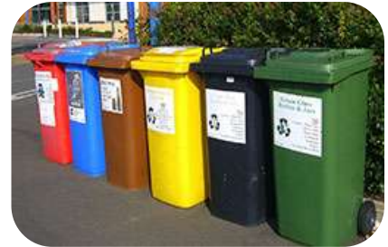
Waste Bin Management