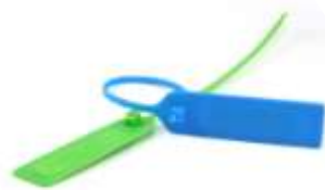
RFID ABS cable tie tag