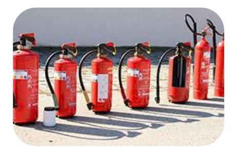
Gas Cylinder Tracking