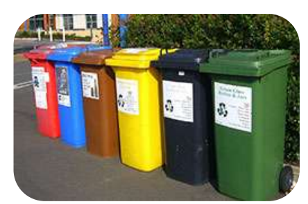
Waste Bin Management