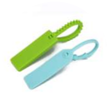
RFID silicone tie tags

Custom RFID cable tie tags made of different material, could offer more choice suitable for your project, such as silicone cable tie tags, ABS cable tie tags, PP cable tie tags, etc.