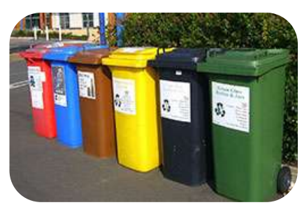
Waste Bin Management