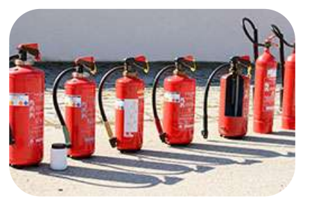
Gas Cylinder Tracking