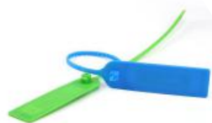
RFID ABS cable tie tag