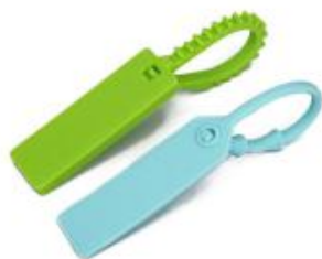
RFID silicone tie tags

Custom RFID cable tie tags made of different material, could offer more choice suitable for your project, such as silicone cable tie tags, ABS cable tie tags, PP cable tie tags, etc.