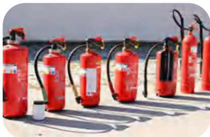
Gas Cylinder Tracking