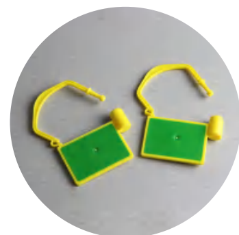
RFID PP tie tag