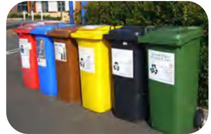
Waste Bin Management