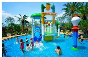
Water parks & pools