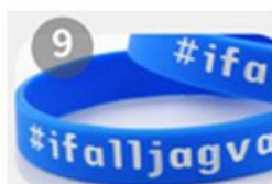
Debossed with color