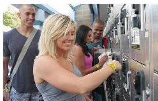
Gyms & Spas

The data on the wristband is accessed by RFID systems such as RFID Smart Readers and can enhance your bottom line and provide unmatched safety, security, and convenience to your guests for: