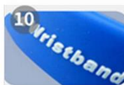
Embossed with color