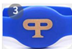
Laser with color