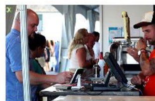
Clubs & Resorts