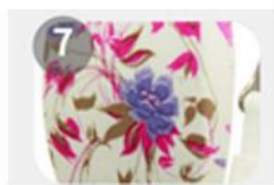
Heat transfer printing